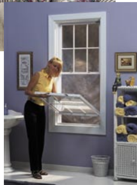
Our fusion welded double-hung windows offer beauty, maintenance freedom, and peace of mind at a price you can live with.