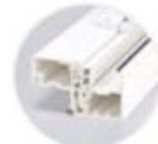
Meeting rails with Integral sash interlock.

Beauty, Comfort, Value enjoy living in greater beauty and comfort, and increase your home's value today.