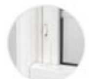
Ventilation limit latch and tilt-latch.