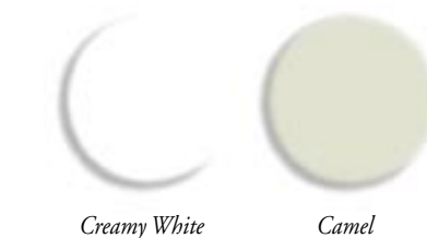
Creamy White Camel

BayShore Windows and doors are manufactured in solid vinyl for color retention and are available in creamy white or camel.