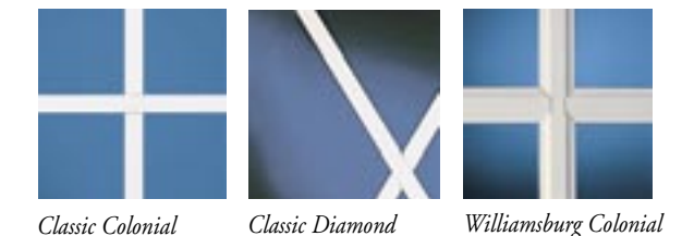
Classic Colonial Classic Diamond Williamsburg Colonial

We offer elegant detailing with our Classic or Williamsburg style grids. Each is mounted between two panes of insulating glass for protection and easy cleaning.